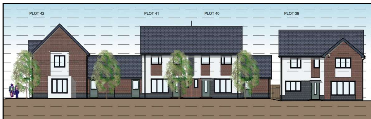
Figure 4 – Examples of proposed detached and semi-detached houses which overlook the public open space/attenuation basin located in the south-western corner of the site

providing good levels of access through the site and connectivity with nearby community facilities and services, such as the train station.