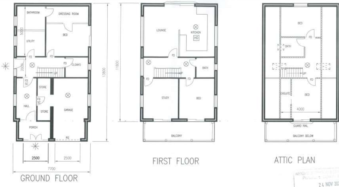
Figure 5 Floor Plan