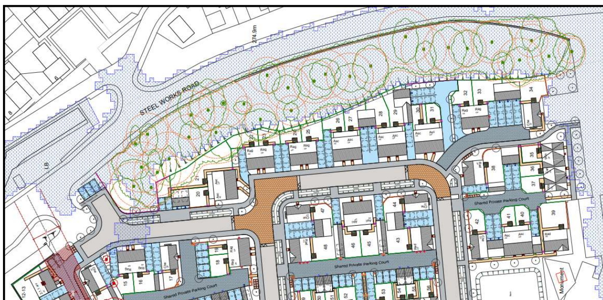
Figure 2 – Extent of Flood Zone C2 (Hatched blue)

The River Ebbw is located just to north east of the application site on the far side of Steel Works Road. The River Ebbw enters a large culvert at this location and remains culverted for a length of 160m where it subsequently discharges into an open channel south of the site. The majority of the application site, including all areas where houses are proposed to be located, falls outside of the Flood Zone C2 as defined on the Development Advice Maps that accompany the Welsh Government's Technical Advice Note 15: Development and Flood Risk (TAN 15). There are, however, certain areas of land within the application site that fall within this flood zone. In particular, the tree covered area of land that runs along the eastern boundary of the site (shown at the top of Figure 2 below, adjacent to Steel Works Road) falls within Flood Zone C2. This is primarily due to it being at a lower land level than the majority of the site that has previously been raised and re-profiled to create a development plateau (planning permission C/2009/0023 refers). No built development is proposed on this lower lying area of land.